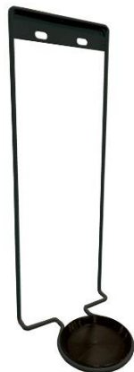
HGPT0070B Matte black epoxy finish