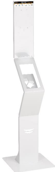
HGPT0040 White epoxy finish